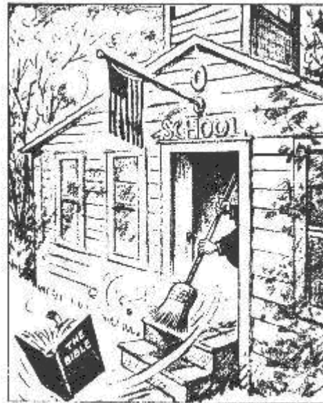
“ONE NATION, UNDER . . . GOD?”

They don't want American to return to God; likewise they don't want God to return to us.